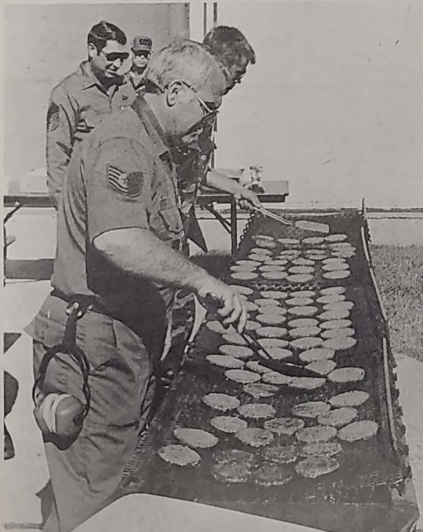
U.S. Air Force Photo Unit members all pitched in to ensure there were enough hamburgers and hotdogs for everyone during the day.